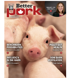
Article appeared in October 2020 issue of Better Pork

system to operate in the cold weather to compensate for this potential issue.