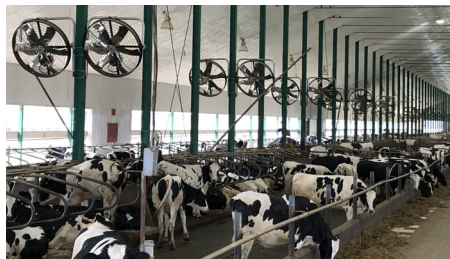
Same innovative, low cost 54" fans with stainless steel blades