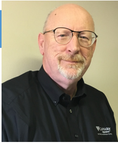
By Rick McBay Natural Ventilation Specialist

You have many factors to consider when designing a ventilation system for your dry sow or breeding facility to ensure your barn will provide an optimal environment for your pigs. The three basic options are natural, dual or power ventilation.