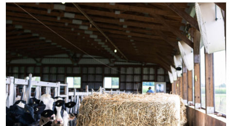
PRF fans keep these cows comfortable.