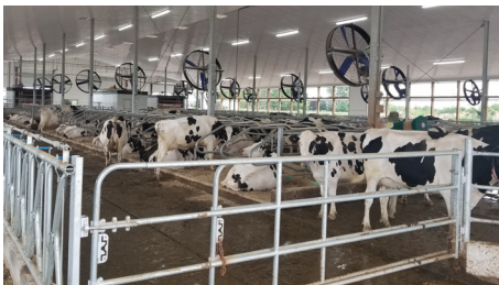
Innovative, low cost 54" panel fans with poly blades