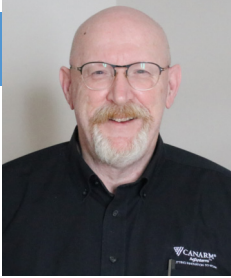
By Rick McBay Natural Ventilation Specialist

Over the years natural ventilation has lagged behind with regards to control technology. This is mainly due to the fact that, unlike mechanical ventilation, which requires a controller to adjust power levels or turn fans and inlets on and off, natural ventilation curtains or panels can be operated with a simple hand crank. The simplicity of this system was appealing both from an initial investment and an operating cost point of view.