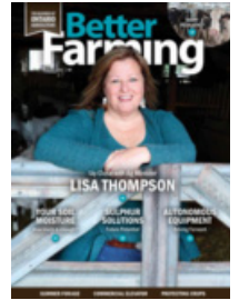
Article appeared in August 2021 issue of Better Farming

Fast forward to today, where our society is technology-driven with advancements arriving seemingly every day. In my 40 plus years of experience, I have seen the largest increase in technology during my lifetime than any generation before. As is the case with many other sectors the same can also be said for the dairy industry.