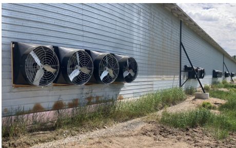
Some of our fans making an appearance at Dunphy's Poultry Farm Limited in Keswick, New Brunswick!