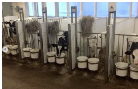
Check out these Comfy Calf Suites on Prince Edward Island at Casa Barra Farm!