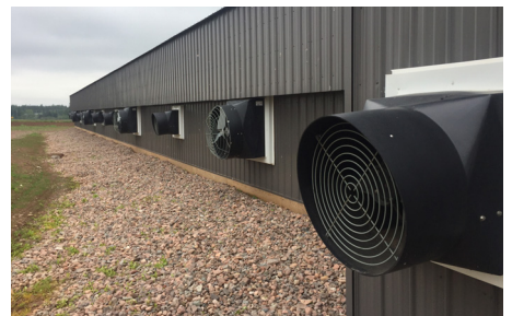
Some of our fans at Bayview Poultry Farms Ltd. in Masstown, Nova Scotia!