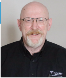
By Rick McBay Natural Ventilation Specialist

Designing a natural ventilation system for your dairy involves putting together two necessary elements that create optimum conditions for year-round cow comfort. The basic design involves creating sidewall openings to allow adequate air movement throughout your barn in the spring, fall and summer, in addition to