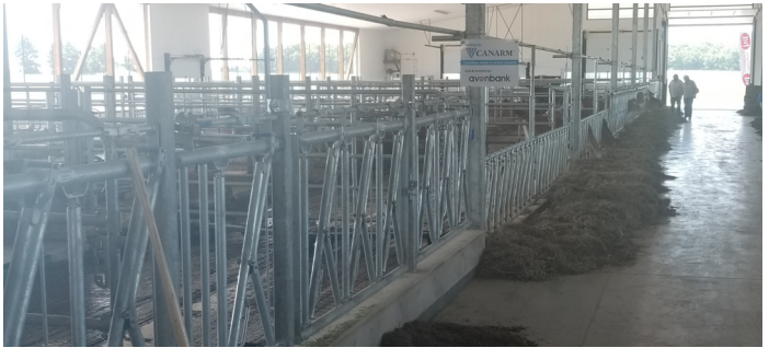
Van De Walle Dairy barn. This beautiful new facility features Canarm freestalls, gates, feed fronts and waterers. Another great job by Avonbank!