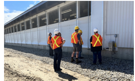
Our Arthur crew recently took a field trip to a barn under construction in Guelph, ON. Job is being completed by Frey Building Contractors.