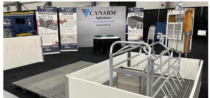
The Canarm AgSystems booth at Alberta Pork Congress in Red Deer, Alberta

Stay Connected with Us. Follow us on Social Media.