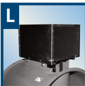
WC - WEATHER COVER