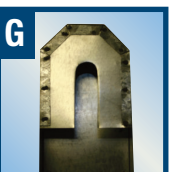
BLG - BELT GUARD