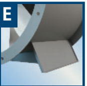
SPL - SUPPORT LEGS