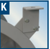
SCH - HORIZONTAL SUPPORT CLIP