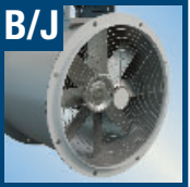
MC - GUARDS