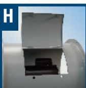
ID - INSPECTION DOOR