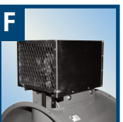
MCVR - MOTOR & BELT COVER