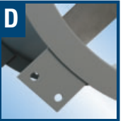
SCV - VERTICAL SUPPORT CLIPS