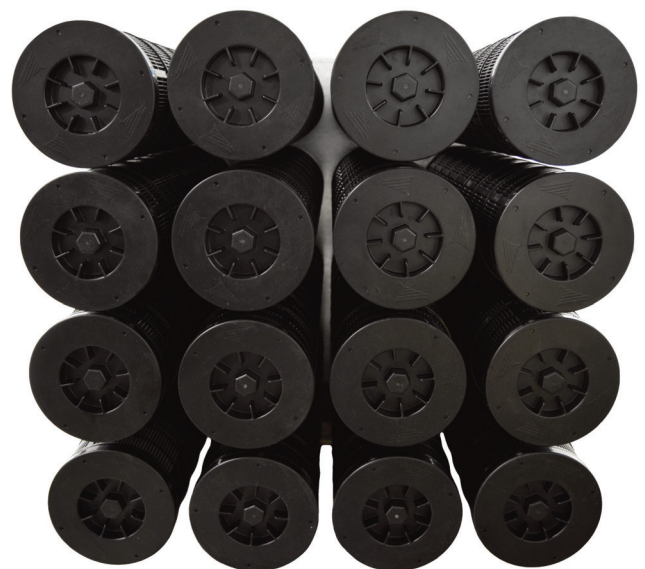
SCT-IDB12 with 16 filters shown