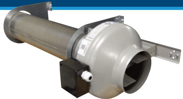
SCT-DFRC6ES with 1 filter