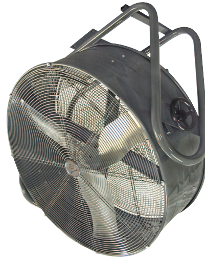
COMES WITH CEILING MOUNT CONVERSION KIT