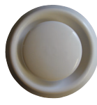
EXHAUST & SUPPLY GRILL