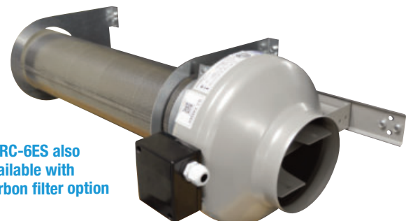
DFRC-6ES also available with carbon filter option