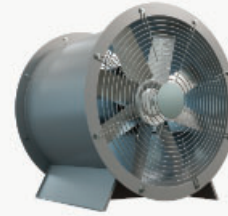
Low Stand Industrial Mancooler Steel or Cast Alum Blade 12" - 48"