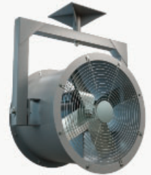
Yoke Mount Industrial Mancooler Steel or Cast Alum Blade 18" - 36"