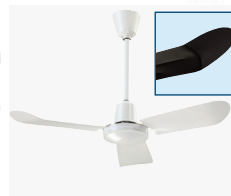
Industrial Ceiling Fan White - 48", 56" & 60"; Black - 48" & 56"