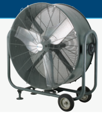
High Velocity Round Drum Fan 24" & 36"