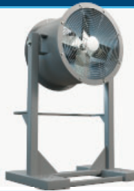
High Stand Industrial Mancooler Steel or Cast Alum Blade 18" - 48"