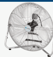
High Velocity Floor/Table/Wall Circulating Fan 12", 18", 20"