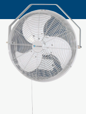
High Velocity Ceiling or Wall Fan 18"