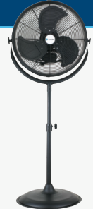
Knock Down Pedestal Fan 20"

CANARM LTD. - Corporate Office 2157 Parkedale Ave., PB Box 367 Brockville, ON Canada K6V 5V6 Tel: (613) 342-5424 Fax: 1-800-263-4598