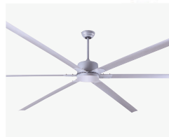
High Performance Ceiling Fans - 8' & 10'