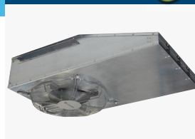
Low Profile Jet Fan