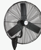
Oscillating Wall Mount Fans 24" & 30"