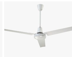
High Performance Ceiling Fans White - 48", 56" & 60" Black - 60"