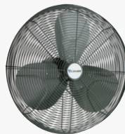
Fan Head 24" & 30"