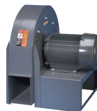
PW SERIES Direct Drive Pressure Blowers