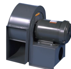
D SERIES Direct Drive Forward Curved Blowers