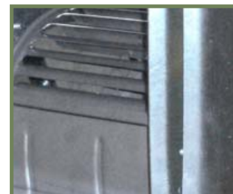
FORWARD CURVED BLOWERS OPERATE AT LOW RPM FOR LOW NOISE