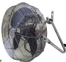
WALL MOUNT BRACKET ASSEMBLY