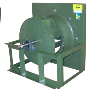
DPL BACK VIEW