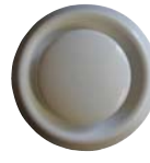
EXHAUST & SUPPLY GRILL